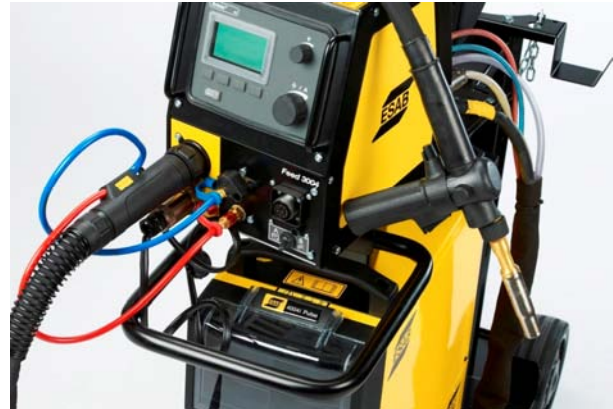
Aristo® Feed 3004 U6 and MXH 400w PP

SuperPulse™ (U8 2 ) is the optimum MIG/MAG process for control of the heat input or bridging of variable gaps.