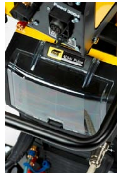
Compartment for wear parts